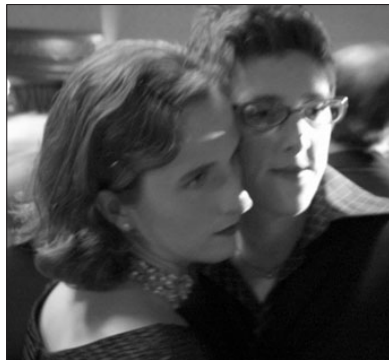
The producer and director of "In Laws and Outlaws" will travel to the festival from Seattle to host a post-film discussion.

While the lineup includes films from national and international artists, many of the feature films reflect the demographics of the Island community. The documentary "Favela Rising" explores the struggle for rights and dignity amid Brazil's dangerous slums, while the festival has teamed with the Wampanoag Tribe to present "Homeland," a piercing look at the efforts of four Native American tribes to fight the US Government's ongoing pollution of native lands. The Net Result fish market is cosponsoring "Fisher Poets," an