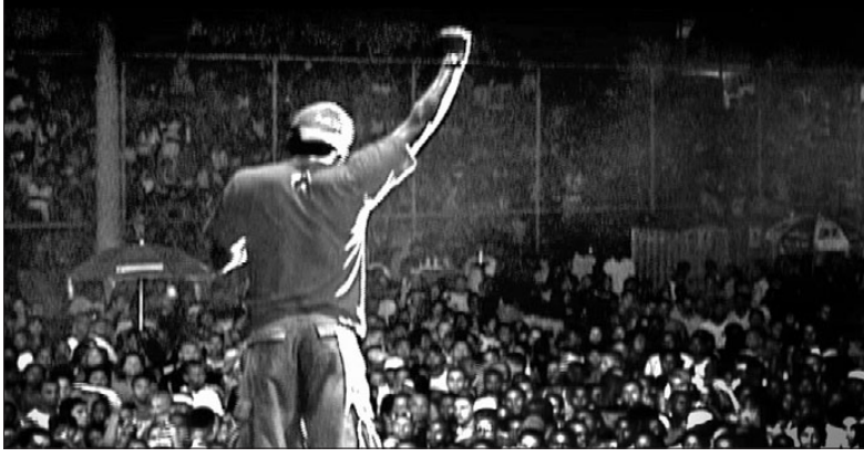
Straight from the favelas (ghettos) in Rio de Janeiro, festival organizers say "Favela Rising" is a must-see.