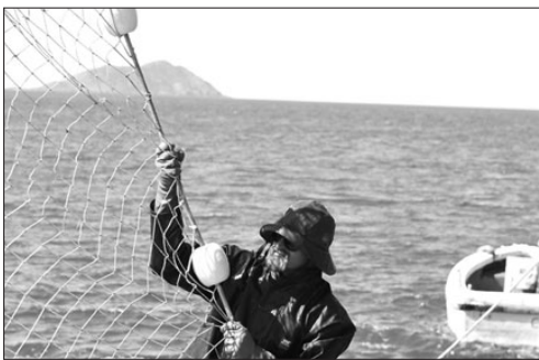
"Fisher Poets" pays homage to fishermen and fisherwomen. Several fisher poets and the filmmakers will travel to the Island to read their works after the screening.

Martha's Vineyard Independent Film Festival starts Friday, March 17, at 7 pm; Saturday, March 18, at 10:30 am; and Sunday, March 19, at 12 noon. For more information